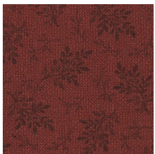
Fabric # 4