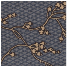
Fabric # 3