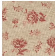
Fabric # 2