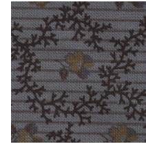
Fabric # 5