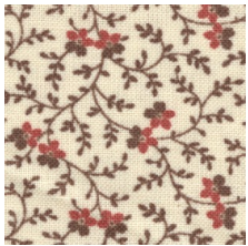
Fabric # 2