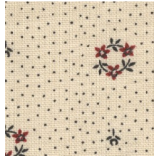
Fabric # 1