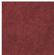
Fabric # 4