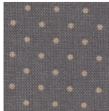
Fabric # 3